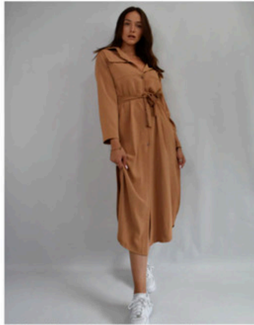
Midi dress with a collar, button placket and wrap design