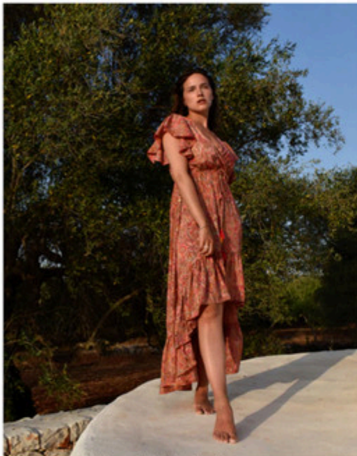
Maxi dress with ruffles and a sloping hemline €79.90 SOLD OUT