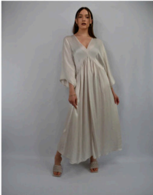
Silky maxi dress €49.90