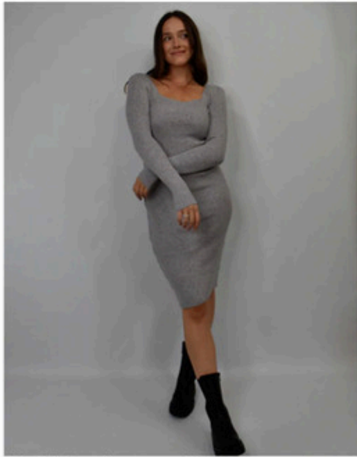
Ribbed knit dress with a square neckline