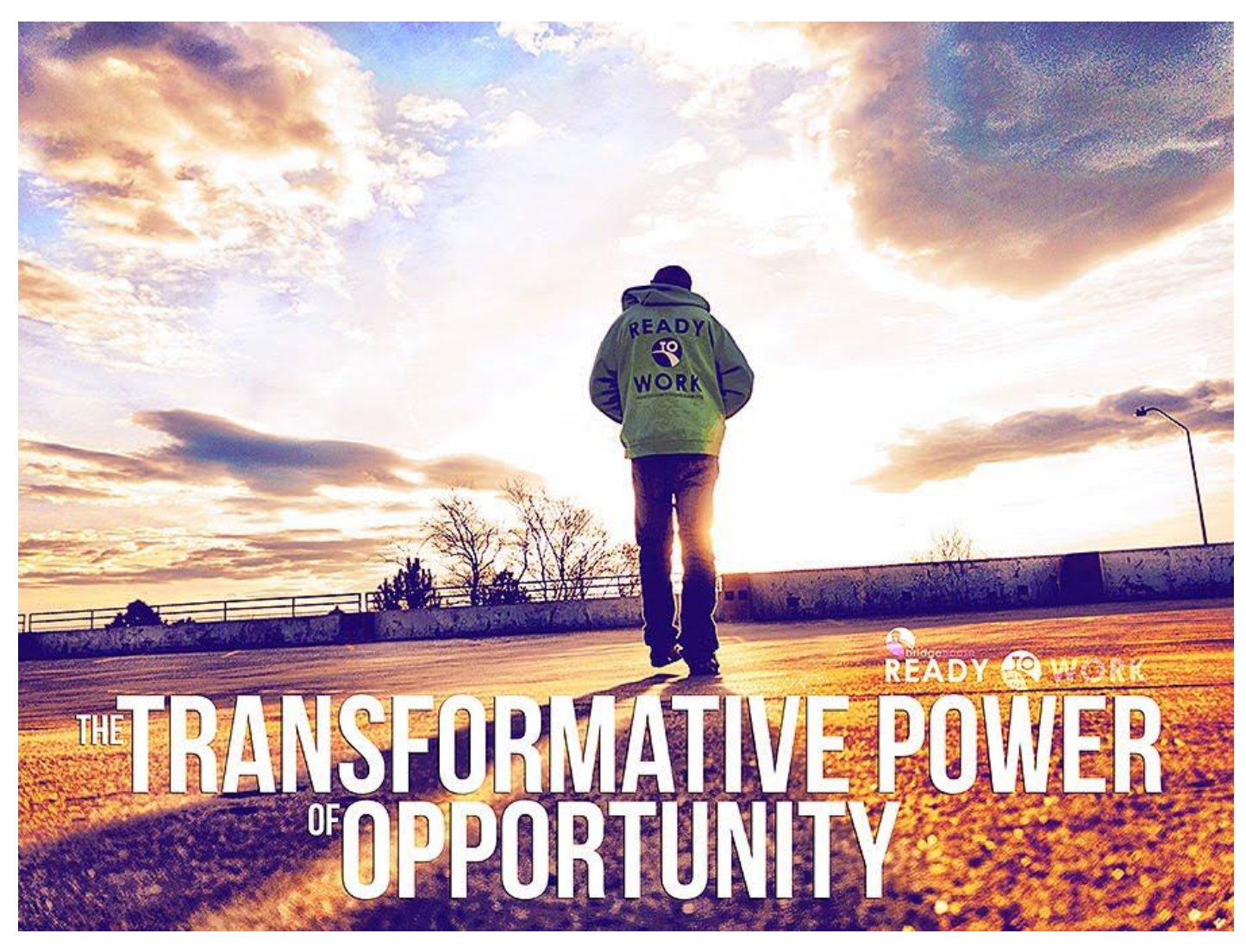
Bridge House Services