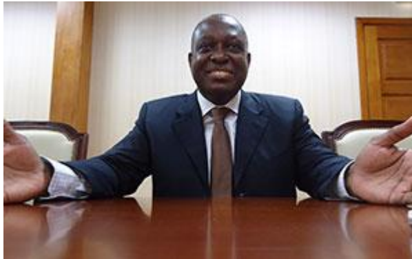
Manuel Vicente, Angola’s vice-president and the former head of Sonangol, Angola’s national oil company, whose fortunes he transformed during his 12-year stewardship