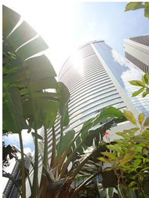
88 Queensway in Hong Kong, the address to which the Queensway group companies are registered