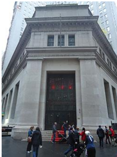
23 Wall Street, the former JPMorgan building in New York now owned by China Sonangol