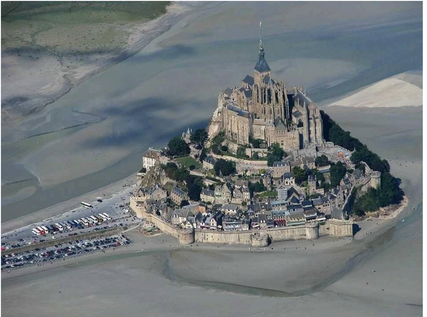
Île de Sein