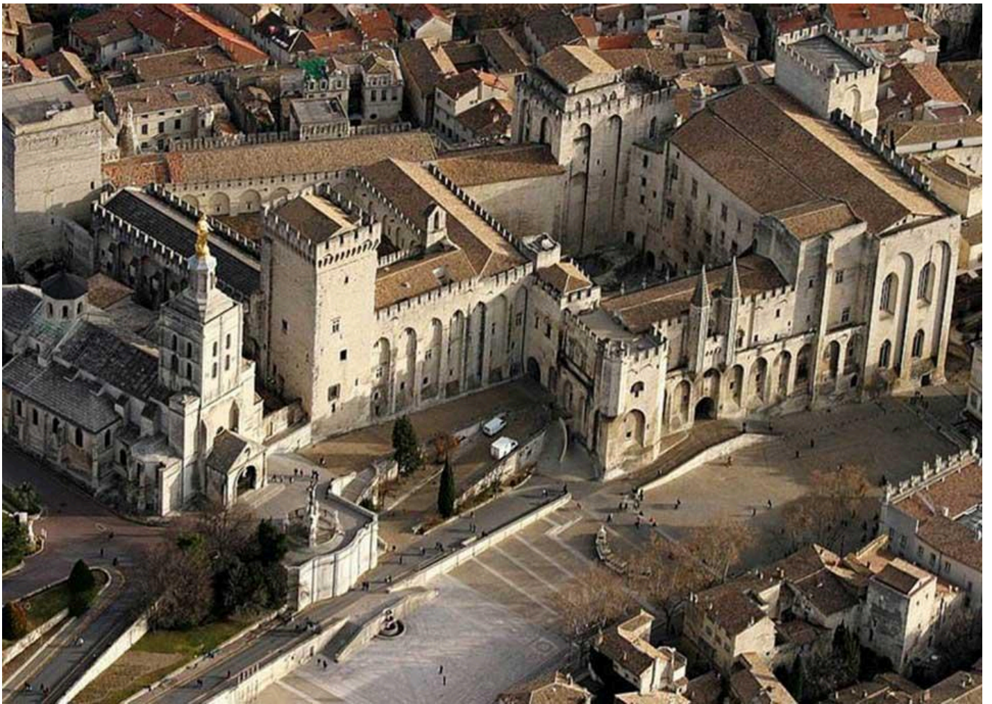
Pic du Midi de Bigorre