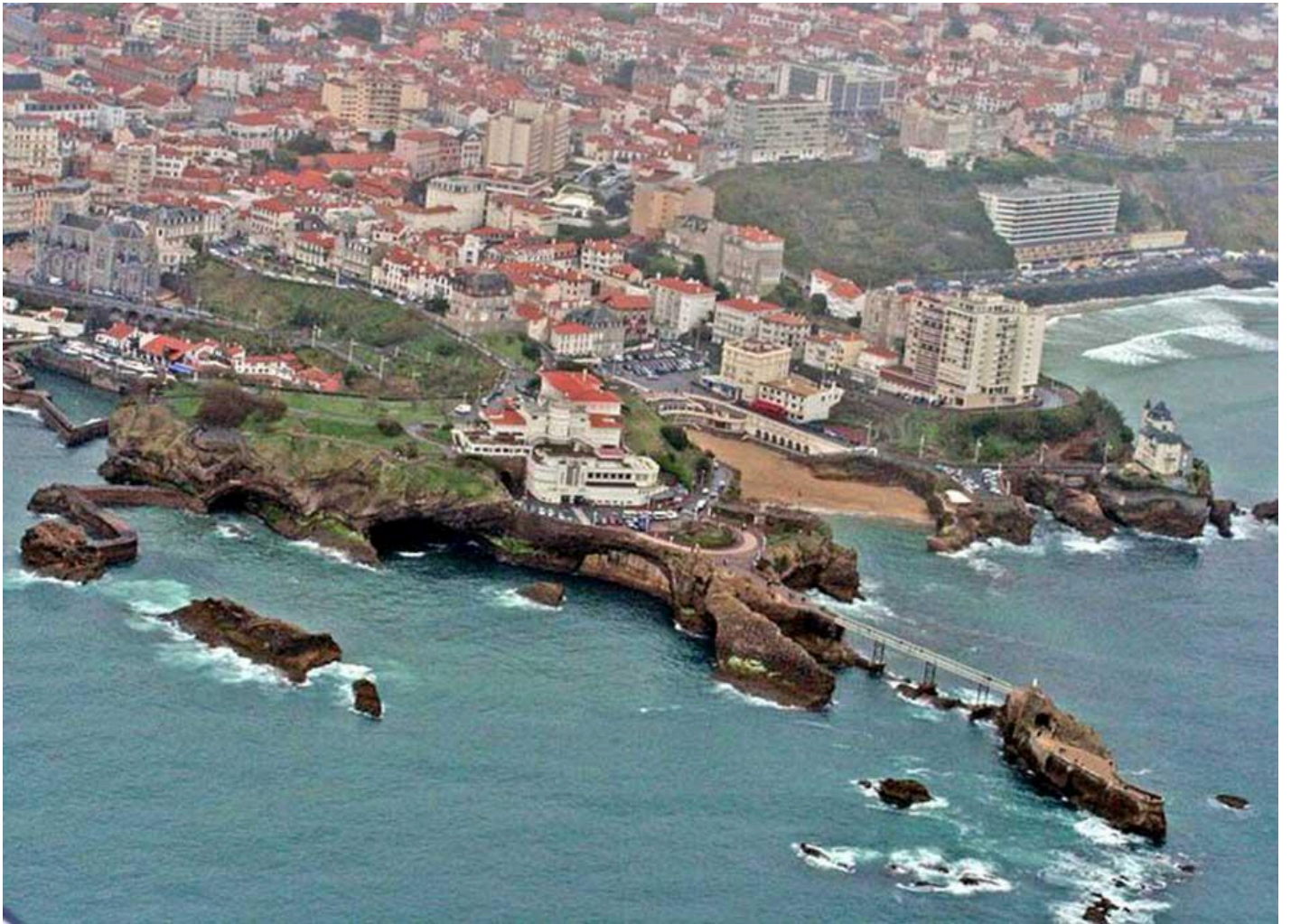
The Great Dune of Pyla