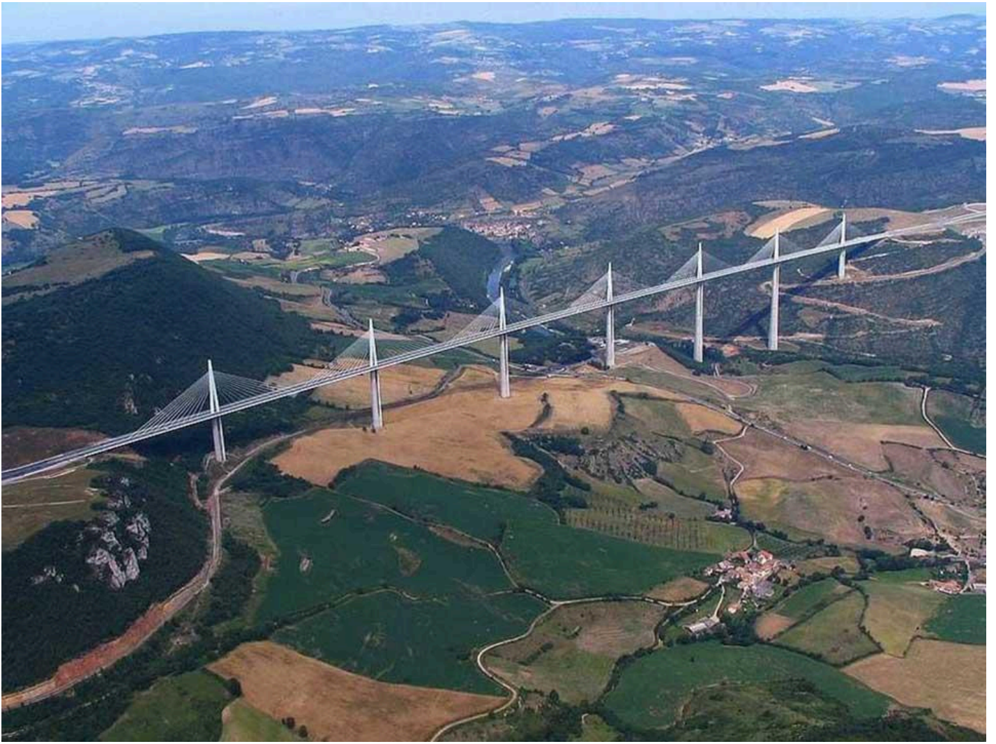
Pont du Gard