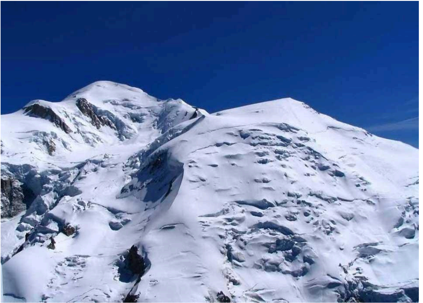
Mer de Glace (Sea of Ice)