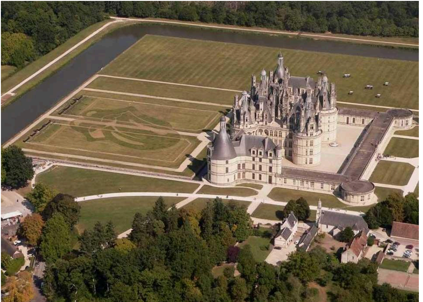
Château de Chenonceau