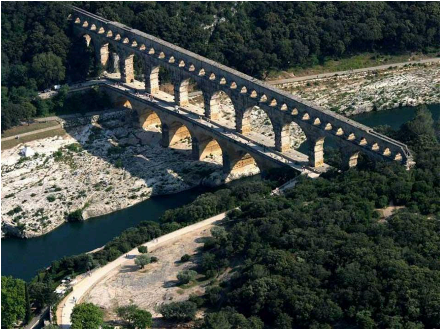
Calanque de Morgiou