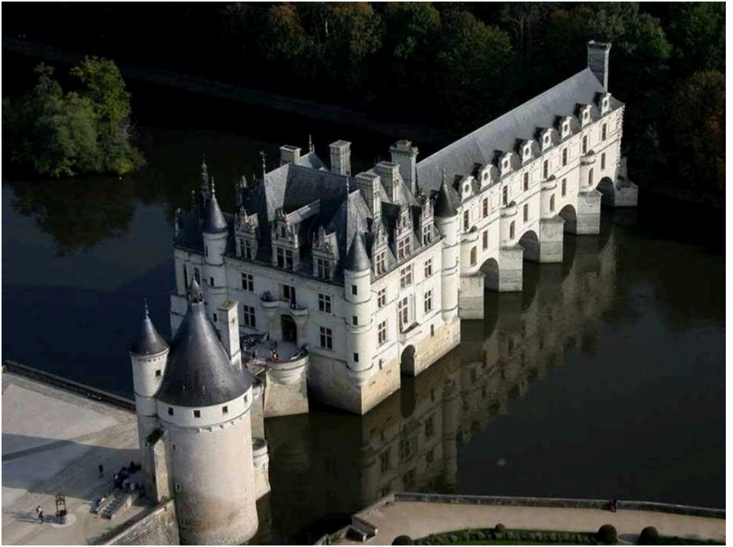
Îles des Embiez