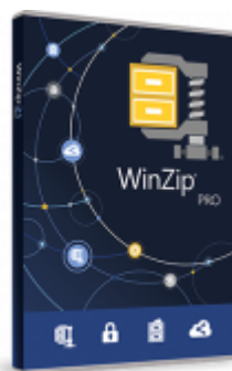
[PORTABLE] WinZip Pro v21.5 Build 12480 – Ita