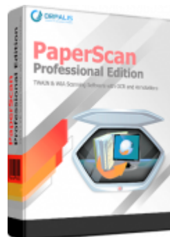
[PORTABLE] ORPALIS PaperScan Professional Edition v3.0.46 – Eng