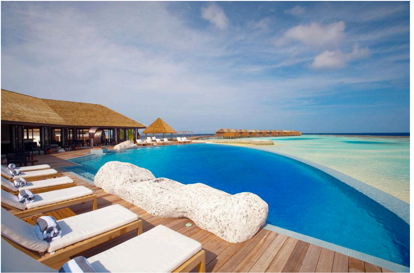
Crystal clear waters and azure blue lagoons...