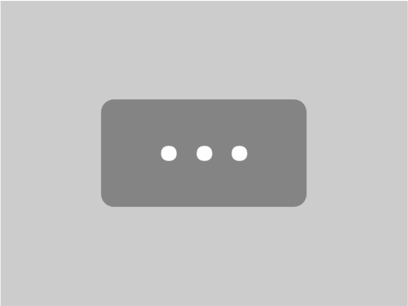
The Truth About Vaccines Docu-series - Episode 6