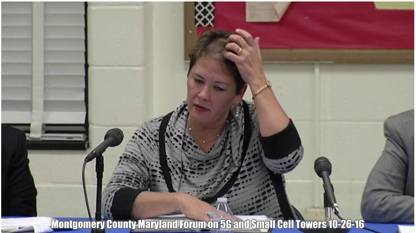
Montgomery County Maryland Forum on 5G and Small Cell Towers 10-26-16

Safe Schools for Prince George's County - Parents, Neighbors, and Students Against Cell Towers on School Property