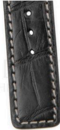
Square with rounded angles