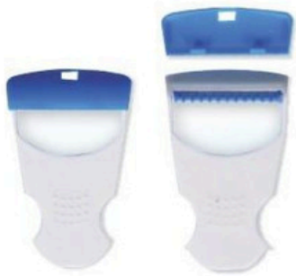
SKIN PREP RAZOR