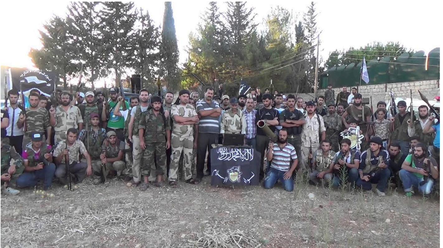
9. Kataeb ayn Jalut (reef Idlib)