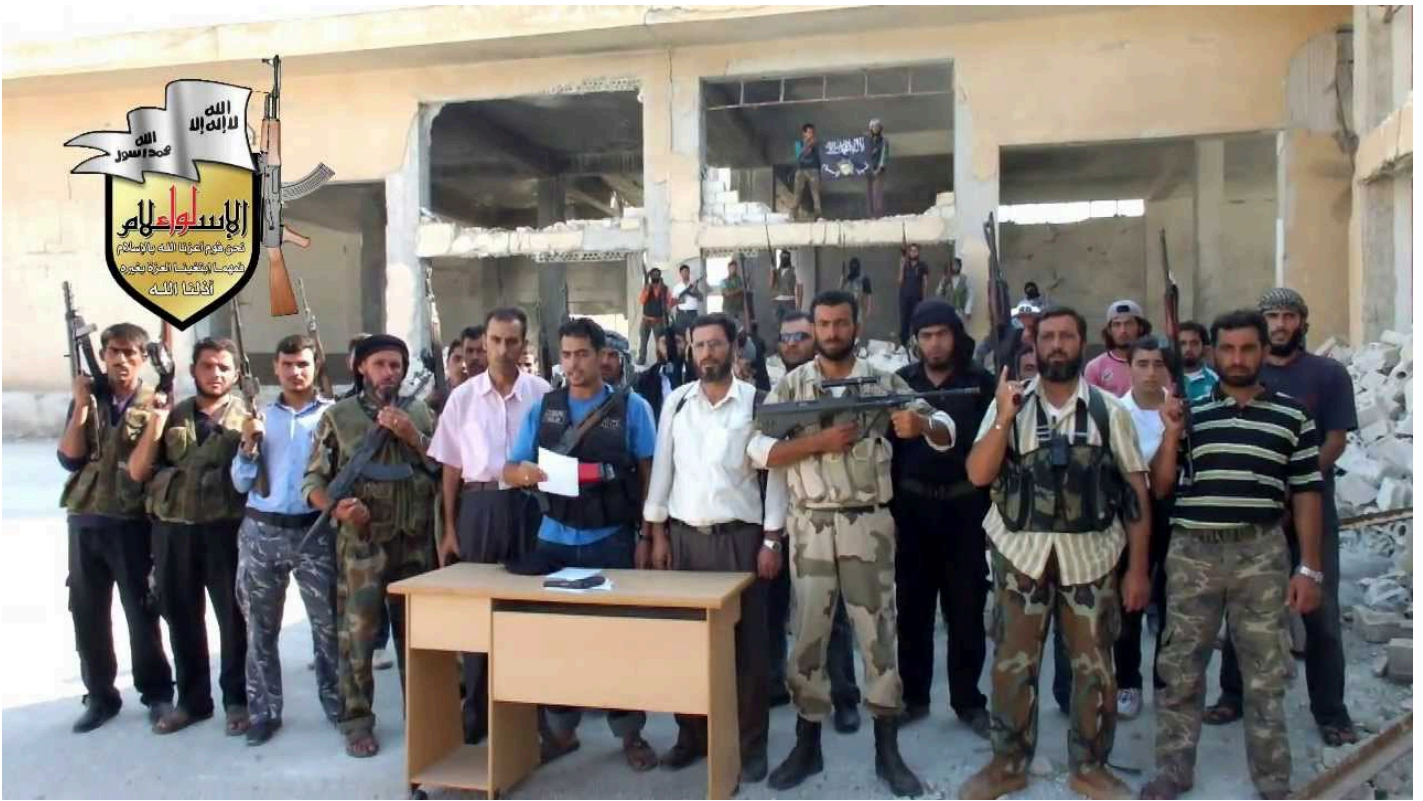
8. Liwa Shuhada al Atareb