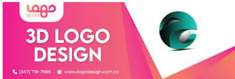
3d logo design

"First impressions stay forever", we've all heard at least hundreds of times throughout our lives. This is especially vital when you are promoting your brand and competing with market professionals. In this competitive world, you must develop a differentiating factor. Even though traditional firms have been implementing it for years, you should employ 3D Logo Design for this. You may communicate your objectives, and these distinctive and appealing symbols can assist you in attracting clients. If you're still using traditional logos to represent your company, it's time to replace them. Let Logo Design Com Co explore how to make the perfect one for the brand.