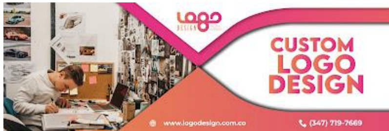
Custom Business Logo Design

Nowadays, there is tough competition in every field to become number one in the market. Your company should stand out to be productive. And also, developing an image for it is a crucial step. Your organization can have real brand awareness with the best Custom Business Logo Design . Your brand logo helps you accomplish your business goals, so it must be top-notch. It is crucial to use a skilled creator when developing this component of your company. Because customers will initially associate this picture with your business. The beauty of your logo will become a major factor in how many consumers perceive your exclusive brand.