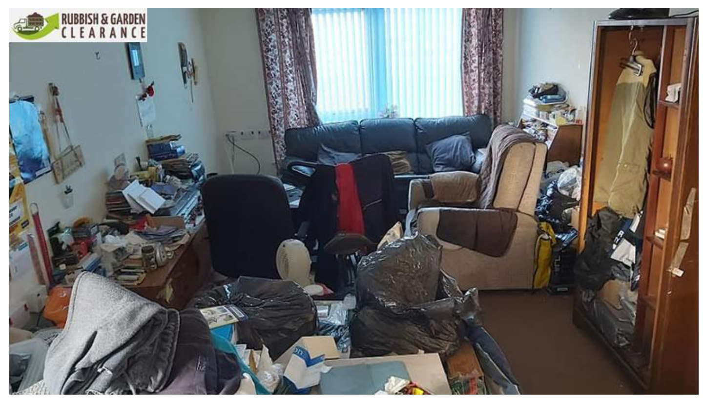
House Clearance Merton | House Clearance Service

Moreover, a professional house-clearance company can also help you with recycling and donating unwanted items. This is especially important if you're looking to reduce your carbon footprint and minimize waste. By repurposing or recycling items, you can help protect the environment and give back to your community.