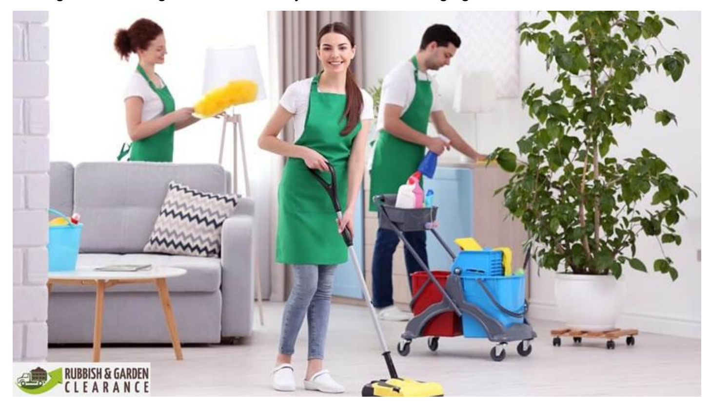
House Clearance Merton | House Clearance Service

We can assist you with cleaning and organizing your living space, including packing and labeling items, storing them in an orderly fashion, and arranging furniture and decor.