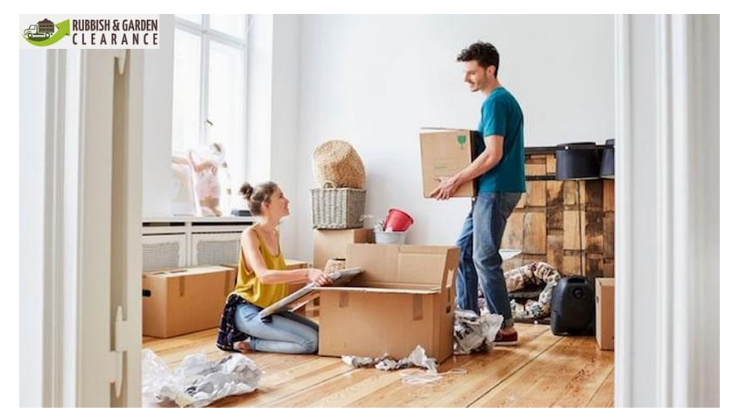
House Clearance Merton | House Clearance Service