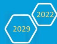
Global Tilt Sensor Market, By Regions, 2022 to 2029