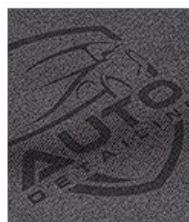
Laser Etching on Clothing