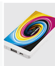
Direct to Product Printing