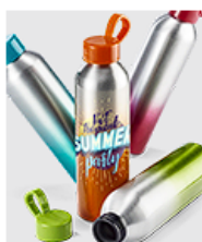
Digital Printing on Drinkware

believing image of care and regard for the earth. Promote your brand name in design without hurting the environment and be the factor for mindful thinking.