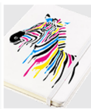
Digital Printing on Notebooks