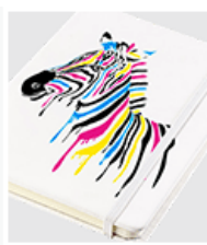
Digital Printing on Notebooks