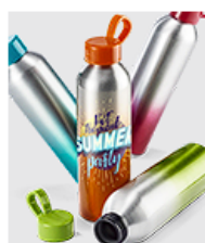
Digital Printing on Drinkware

Table of Contents 9 Questions You Might Be Afraid To Ask About Promotion Clothing 7 Secrets About Promotional Branding You Can Learn From Tv The Ultimate List Of Promo Gifts Do's And Don'ts How To Master Branded Corporate Gifts In 30 Days This Will Change The Way You Look At Branded Clothing Are You Getting The Most Out Of Your Promo Gifts? 7 Hottest Corporate Gifts Trends 4 Reasons Branded Corporate Gifts Is Going To Be Big Soon. Promotional Branding Made Simple: What You Need To Know The Experts Changed Their Mind About Branded Corporate Gifts. Here's Why.