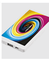
Direct to Product Printing

We will: Source the best product for you Perfectly brand name your picked item with any design you require. Whether it is your company's name, logo, information or all of them integrated. We are likewise all set to help you in any way we can. We can provide you recommendations when choosing your items and manage your corporate present or marketing project.