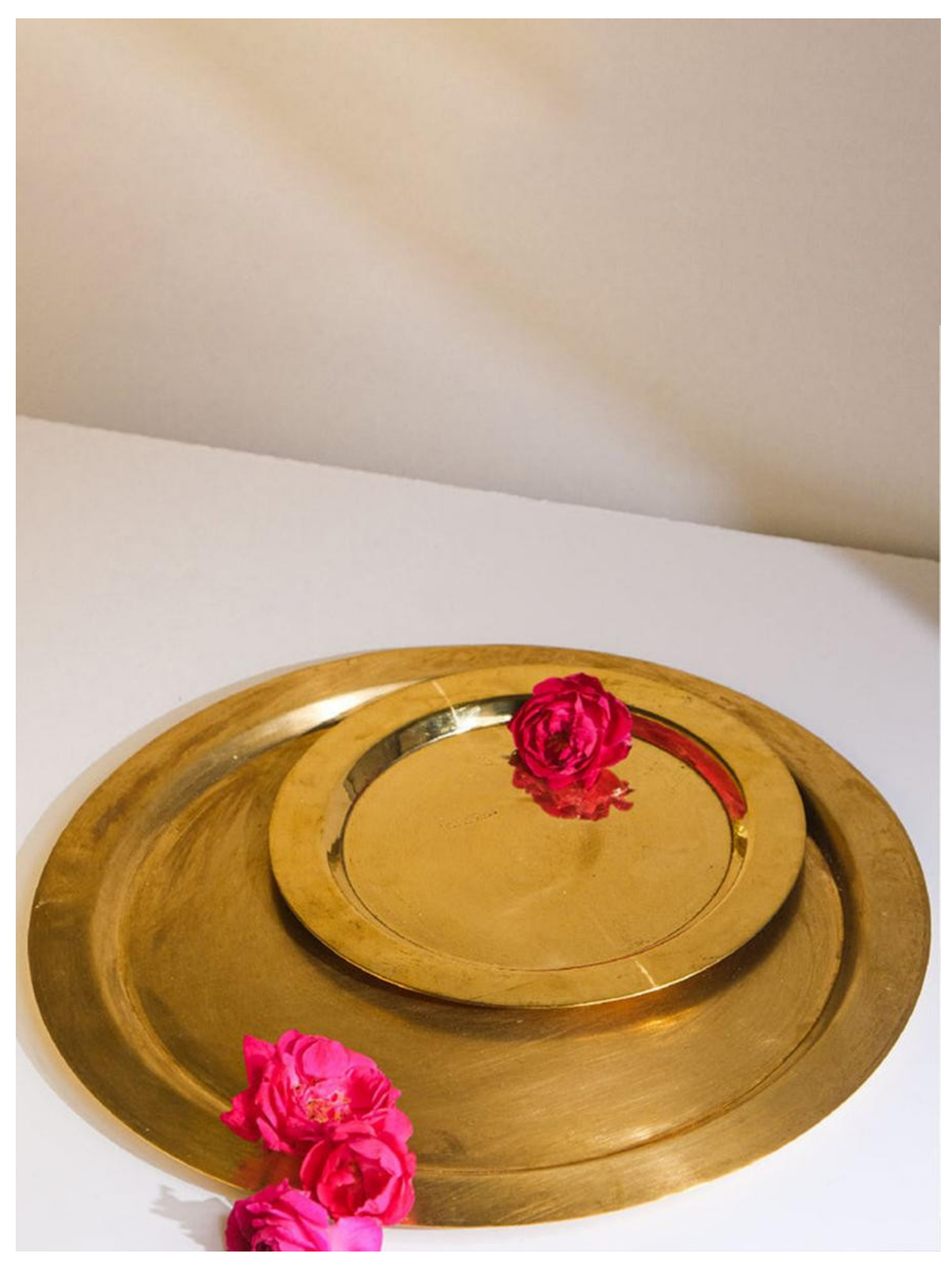
Shopping of crockery from Whispering Homes:

Whispering Homes does not only promise you to deck up your living room or bedroom but also the way you arrange your table. From the vintage styled crockery pieces to the items of