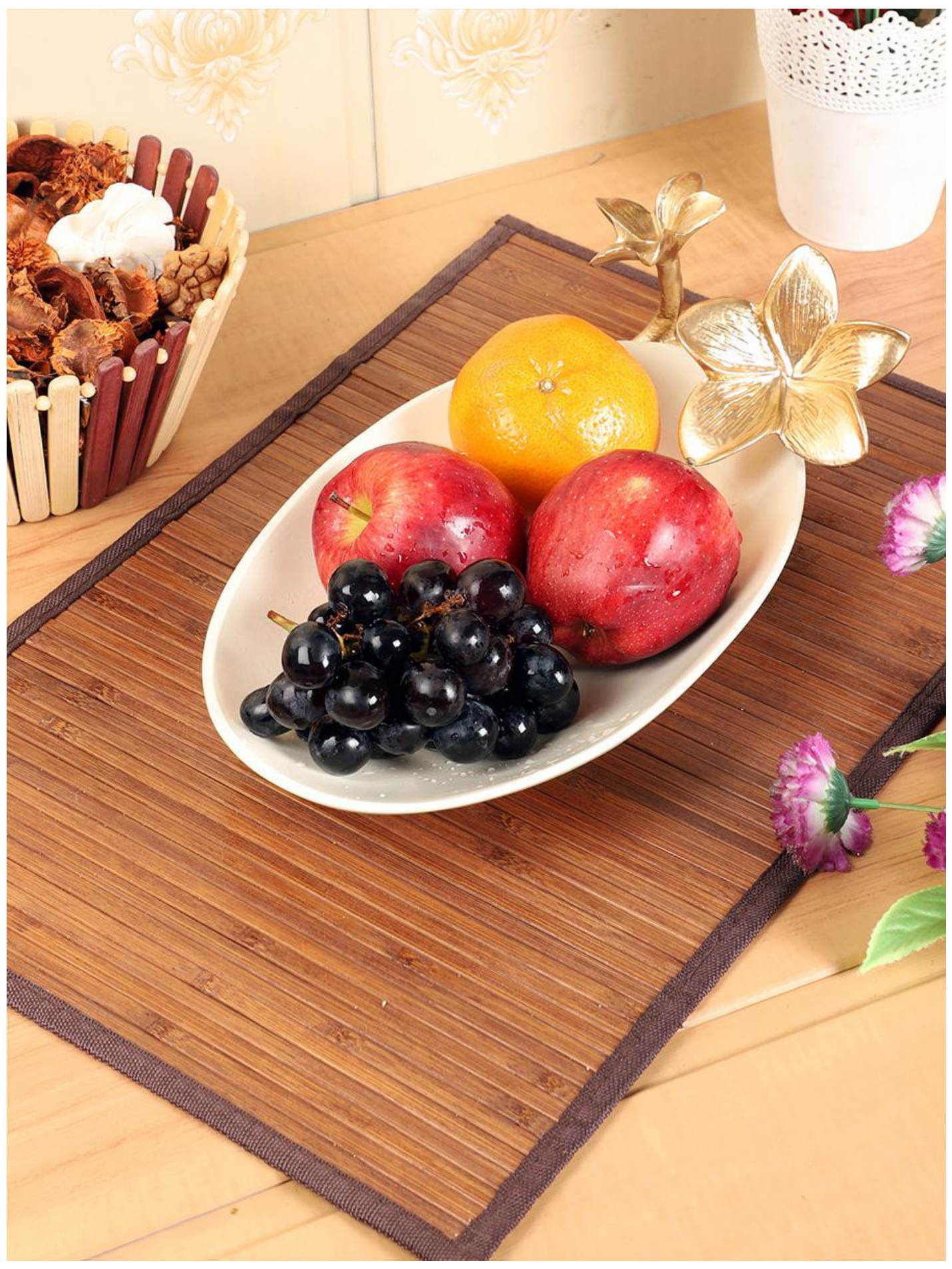
In recent years when the <u>home décor</u> industry is taking a toll with new and classy home décor products, the kitchen and tableware décor is going nowhere less!