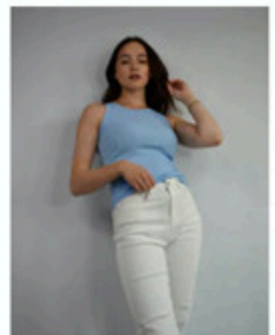
Basic Long Tops