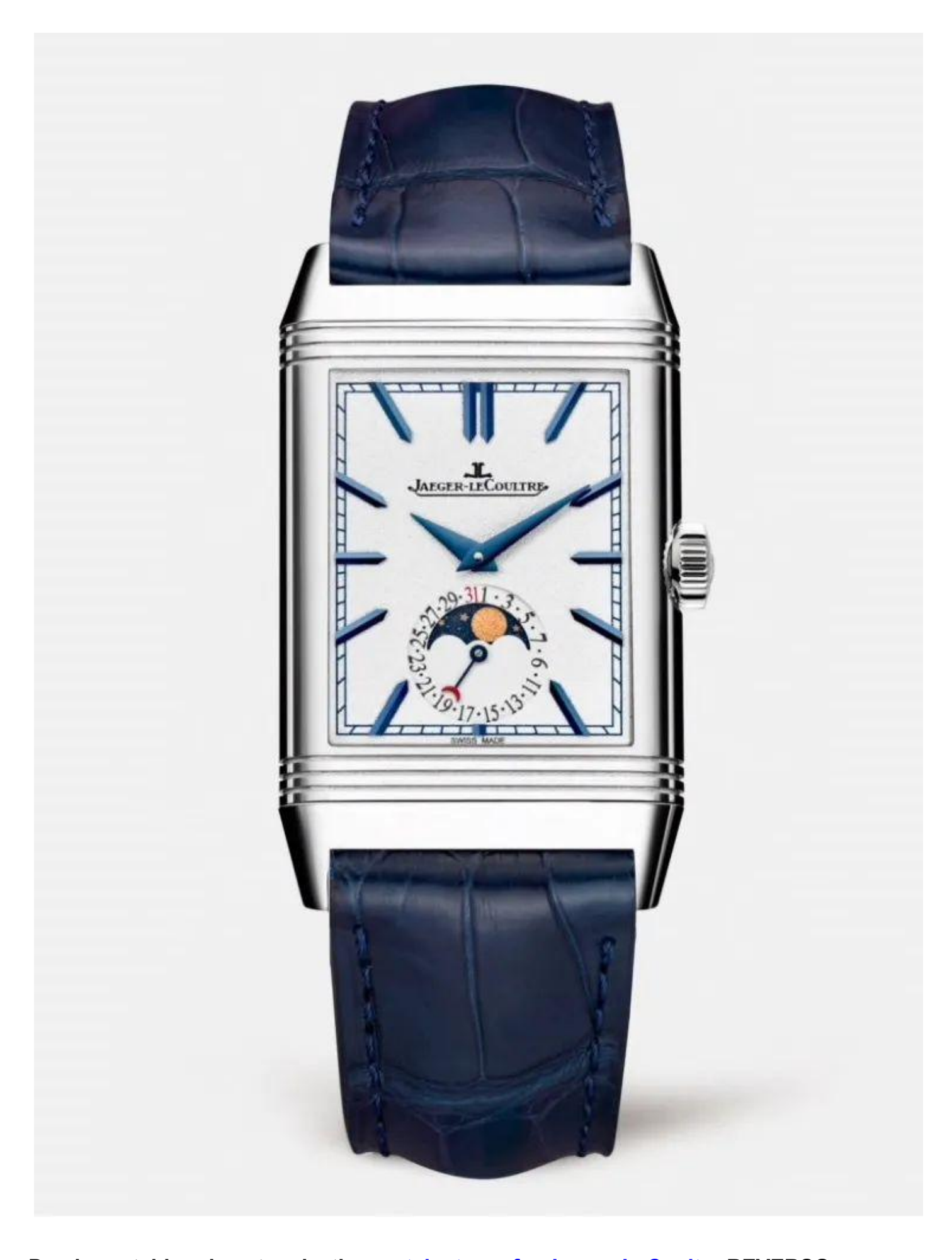
Daydaywatchband custom leather <u>watch straps for Jaeger-LeCoultre</u> REVERSO