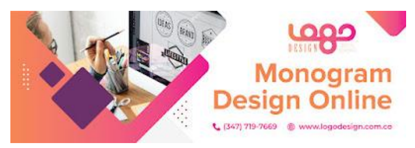
Monogram Design Online

How may a tale be told in the fewest workable words or letters? Well! Making a monogram logo, of course! You can also get <u>Monogram Design Online</u> services in this modern era. Monograms were popular in the late 19th century, particularly in the fashion sector. Some of the most recognizable monogram logo designs belong to high-end clothing companies. Yes! Like Louis Vuitton, Prada, and Gucci since they have been in business for a long time. And yes, they are well-known throughout the world. The sentimental element that a monogram logo design has is what makes it attractive. The usage of letters creates memorable symbols and strengthens the link between the company name and the logo.