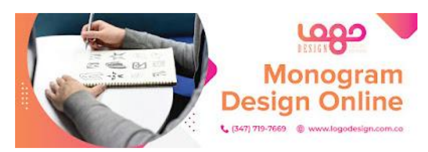
Monogram Design Online

A monogram can be an alternative if you do not include a symbol in your design. And also want your company name to stand out on its own. By mixing initials, you can still come up with a unique logo that is pleasing to the eye. When you first launch your company, you aim to build your name and raise its visibility. In this situation, you should start with a monogram variation on which the full name of your company is written beneath or next to the logo.