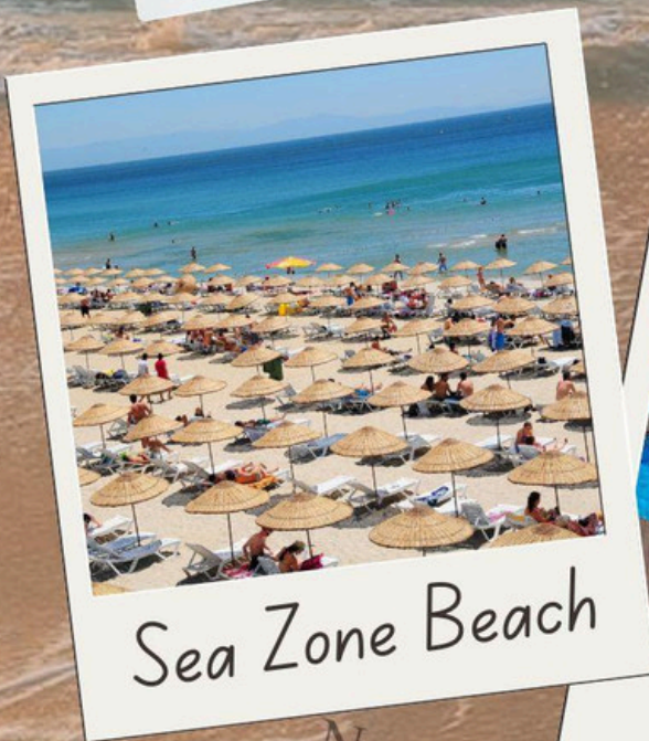
Sea Zone Beach