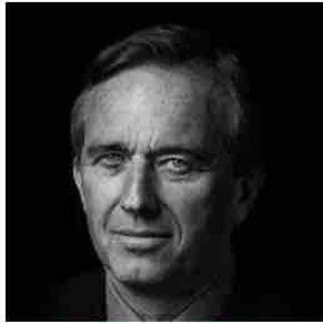
ROBERT F. KENNEDY JR. SPECIAL GUEST INTERVIEW

MEET SOME OF THE EXPERTS FEATURED IN "VACCINES REVEALED."