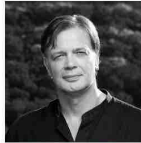
DR. ANDREW WAKEFIELD AUTISM ACTIVIST