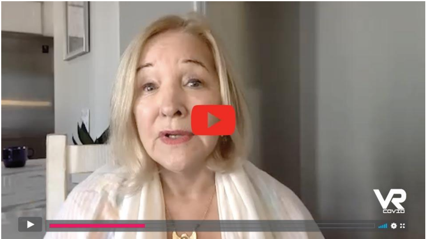
Dr. Christiane Northrup