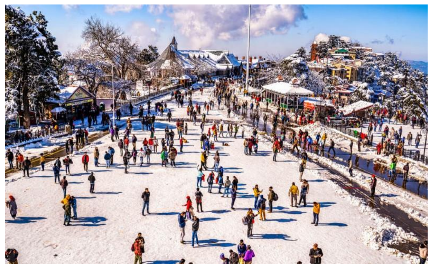
Places to Visit in Manali

partake in adventure activities, visit toursandtreasures sites and relax . In addition, Holidify offers a plethora of affordable and customisable packages for travelling with family or friends and guarantees you a marvellous trip!