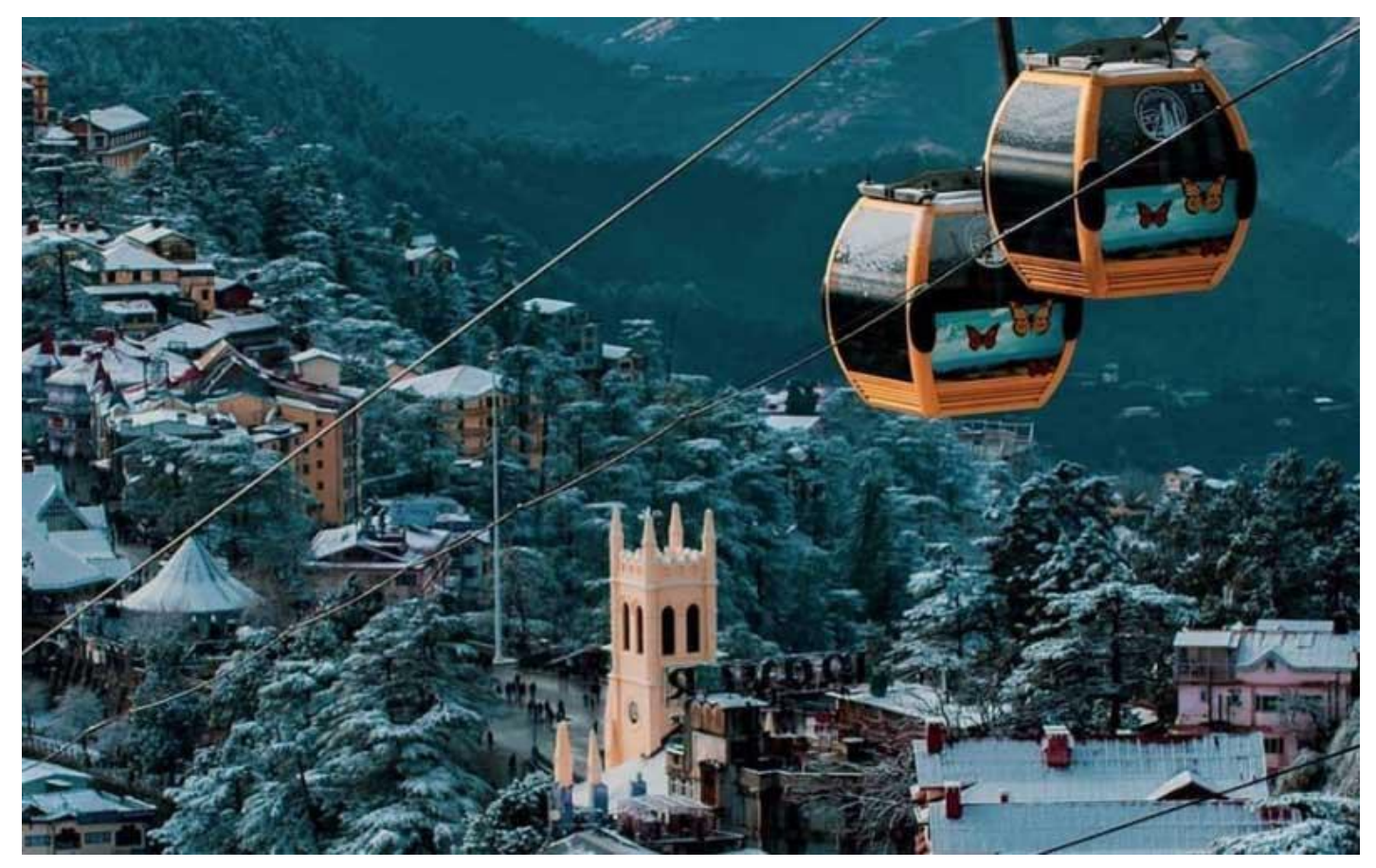
Rohtang Pass: Located at a distance of just 51 kilometres from Manali, Rohtang Pass can be reached only by road. The pass is located at a massive height of 3978 metres on Manali-

Solang Valley: 14 kilometres to the north west of the main town of Manali, Solang Valley is one of the most popular tourist destinations in Himachal Pradesh . It is famous for adventure activities like parachuting, paragliding, horse riding, driving mini-open jeeps, zorbing , etc. During winters, Solang valley is covered with snow, making skiing is a popular sport here.