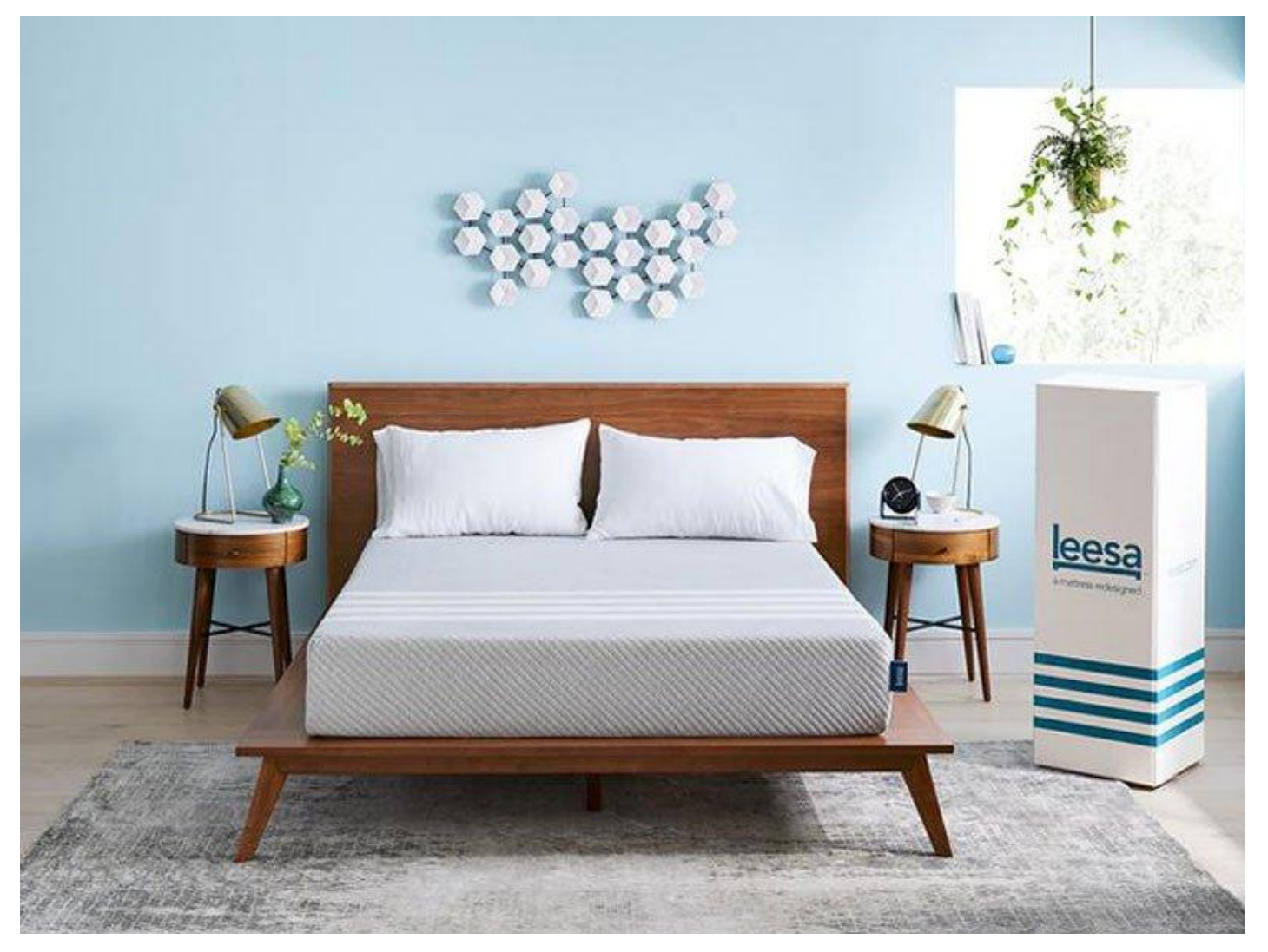
<u>Leesa's July 4 sale is happening now — get up to 18% off, plus 2 free pillows when you buy a mattress</u>