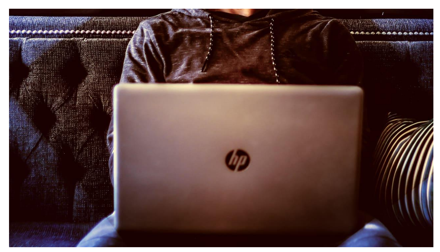
HP and Dell may sharply cut China production to dodge tariffs Fast Company • July 3, 2019, 11:22 am