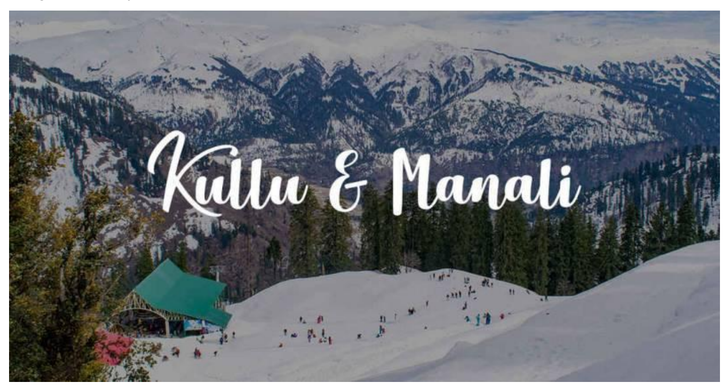
Places to Visit in Manali

Manali travel packages make your stay unforgettable by lodging in resorts, hotels, and guesthouses in picturesque locations, and also includes destinations like Kasol, Shimla, Dharamshala and Dalhousie where you can enjoy views of high snow-covered peaks, partake in adventure activities, visit toursandtreasures sites and relax . In addition, Holidify offers a plethora of affordable and customisable packages for travelling with family or friends and guarantees you a marvellous trip!