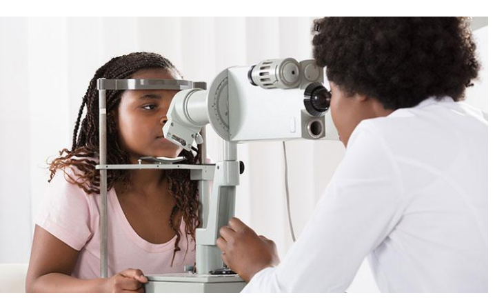
and also take care of ophthalmic problems as well as major diseases that call for intense monitoring.