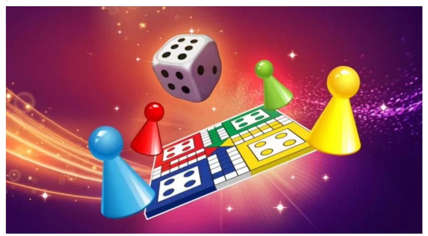
Strategies that will help you win a ludo game:

Ludo is a bridge multiplayer game that can be played on a computer as well as on mobile devices such as iOS, Android, and Windows. The game may also be played as a local multiplayer game or against the computer while offline. While it may appear to be a simple game at first, it demands particular methods and methods to win every time. Many users feel that in these games, chance plays an important part. If you're a Ludo player, we recommend that you continue reading. As a result, we are confident that ludo game applications will pique your interest.