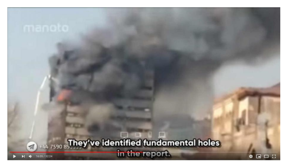
4/22/2018 Manoto TV: Iranian PLASCO Building Collapse Investigation