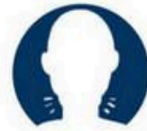
Swollen lymph Nodes