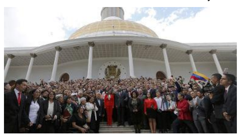
<u>Via BBC</u> - <u>bigger</u> National Assembly - Detail