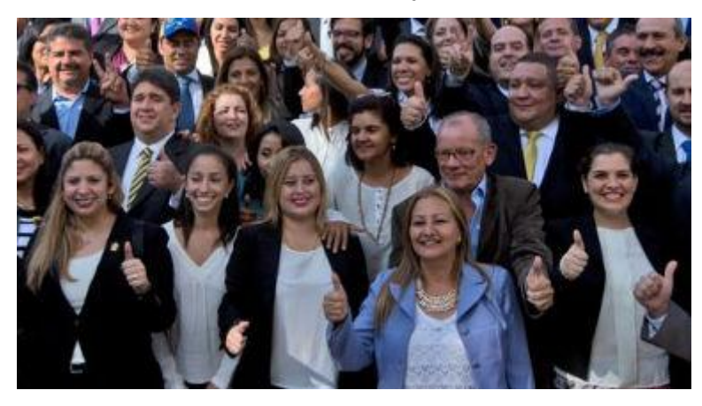
Constitutional Assembly - Detail