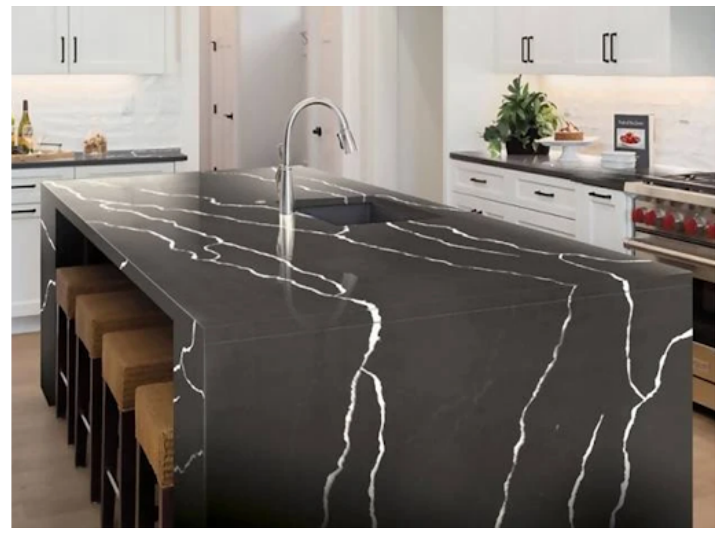
<u>Pietra Grey Marquina Quartz</u> has a darker grey background with authentic white veining designed for modern living with unique designs that make them look more natural.