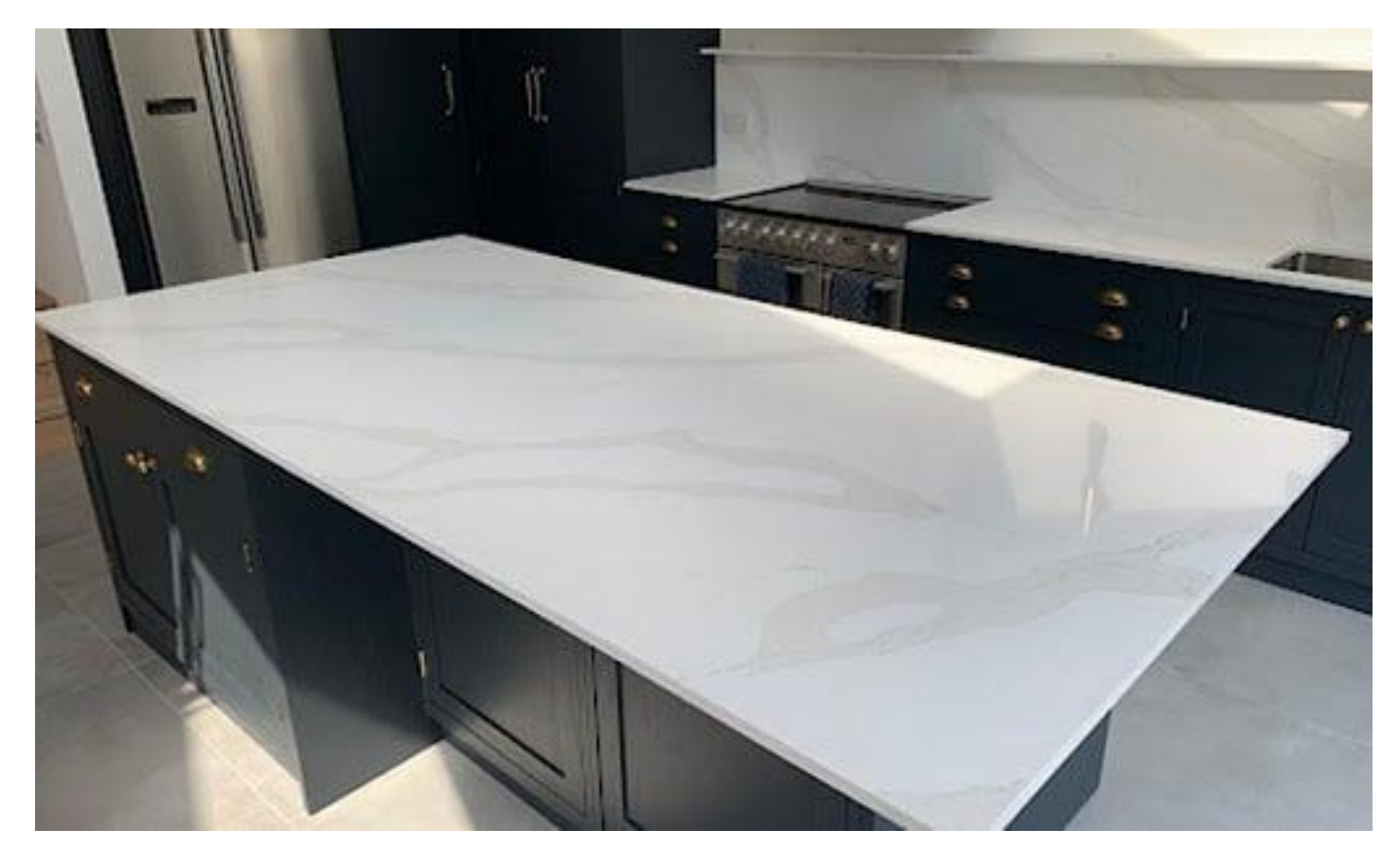
<u>Calacatta Oro Quartz</u> has a light texture of delicate grey veins at affordable high-end looks and life-long durability

It's the perfect choice for creating white quartz countertops.