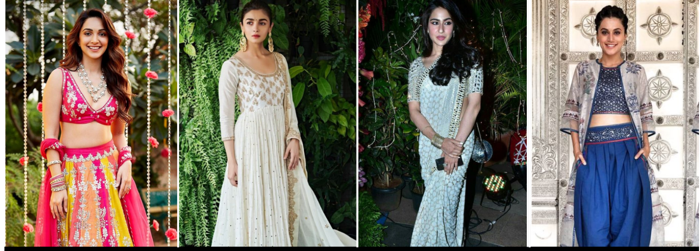
NAVRATRI 2023 OUTFIT IDEAS INSPIRED BY BOLLYWOOD ACTRESSES FOR THIS FESTIVE SEASON!

garba, india, navratri, navratricollection, navratrifestival, navratrilehenga, navratrispecial