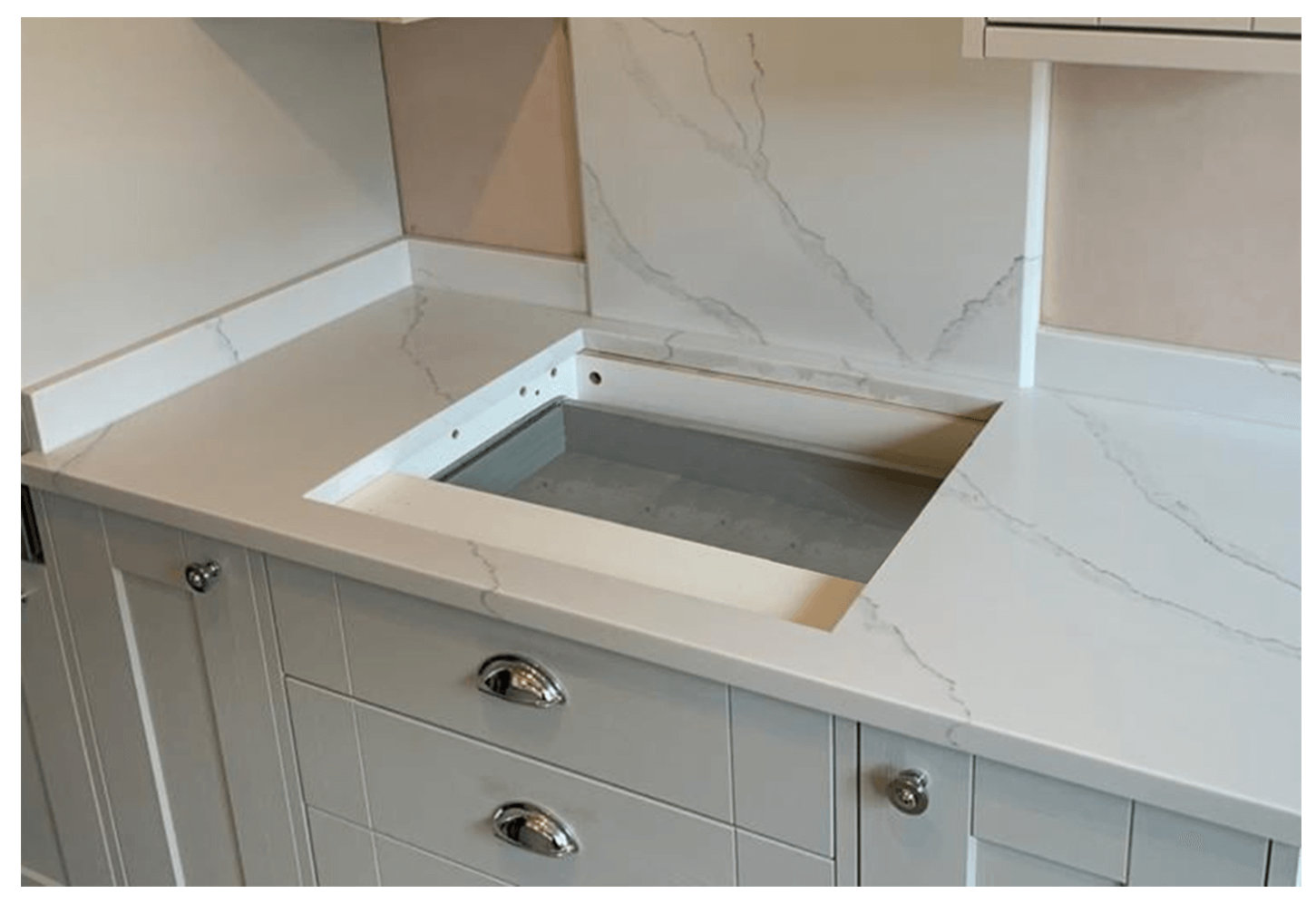
Because of its limited porosity, Calacatta Imperial is very stain-resistant.