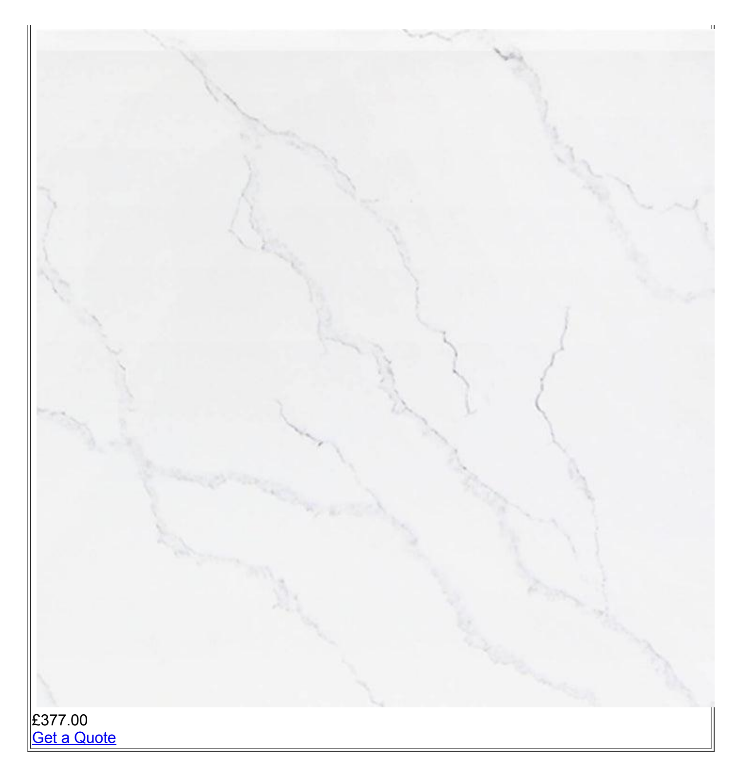
Features and Benefits of Calacatta Imperial Quartz: