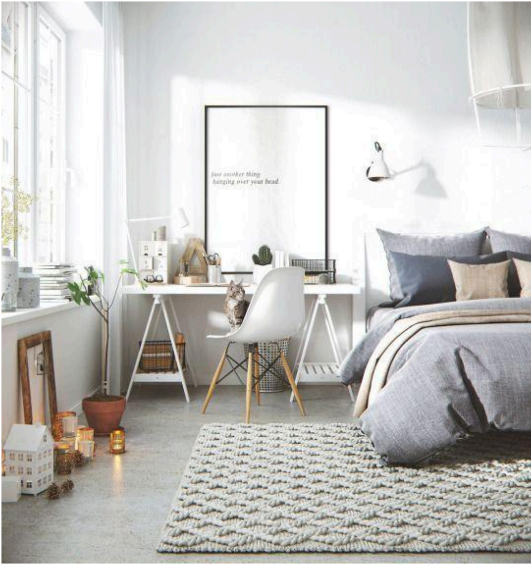
Can be combined with homeoffice.