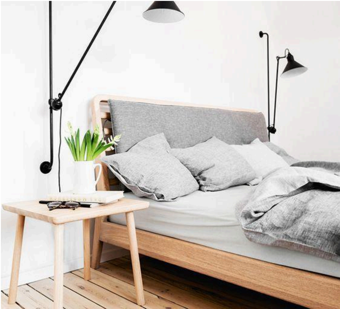
Auxiliary lighting, usually small chandelier, wall lamp or table lamp, is a point of creativity.