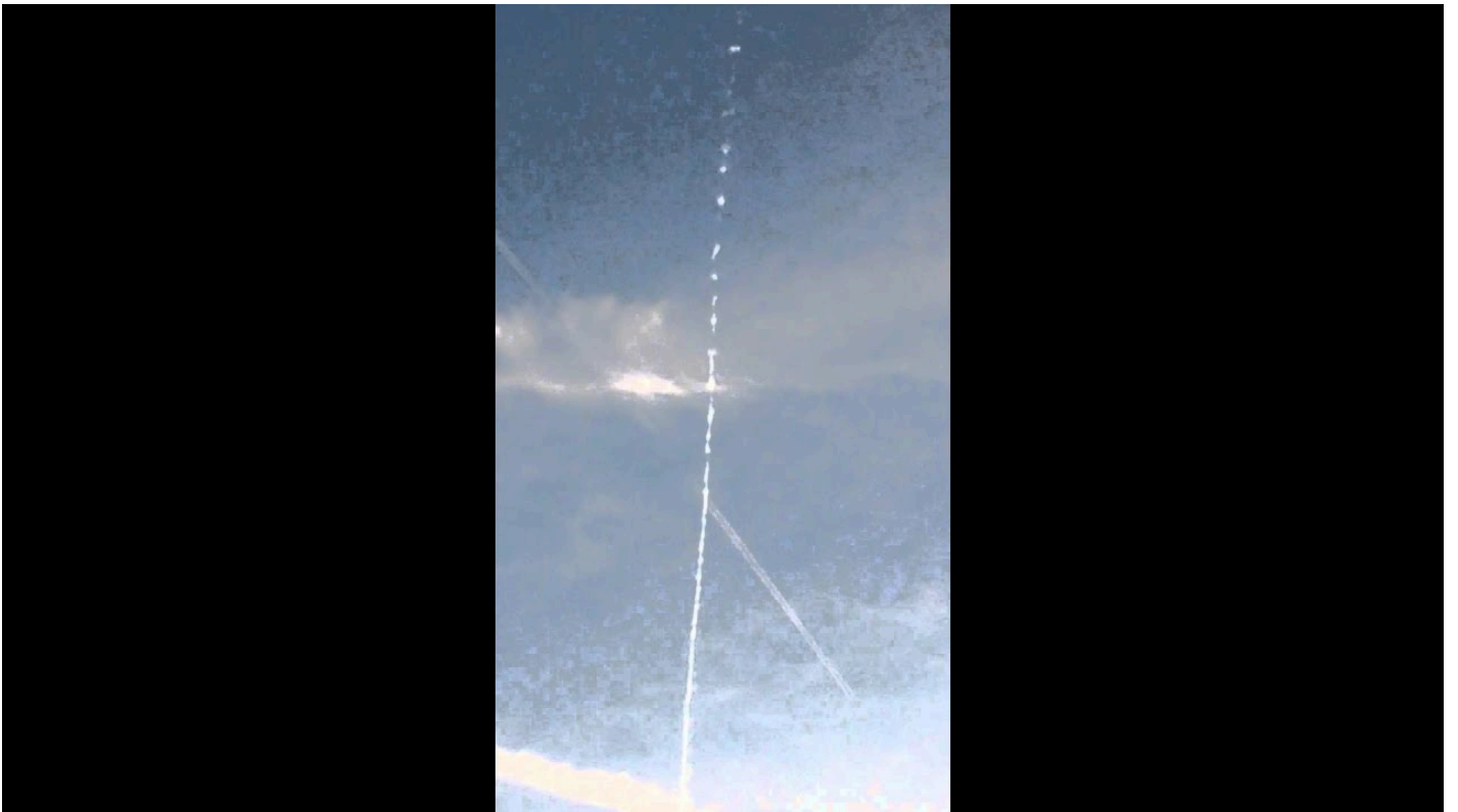
Only 3 trails as Chemtrails nozzle fails on #2 port engine