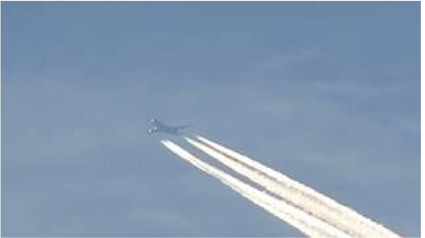
Cape Breton Chemtrails (1b) - Geonengineering/SRM