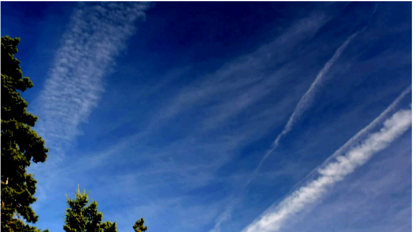
3 Chemtrails from 2 engine jet