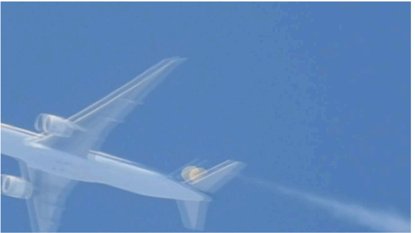
Chemtrails jet runs out of spray with sputtering aerosols released from one side