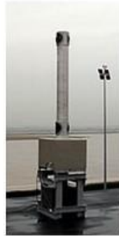
Magna BSP's "owl".

The blast at Fukushima #3, which Israeli firm Magna BSP "secured" with one of their cameras, bears a striking similarity to a nuclear weapon test.