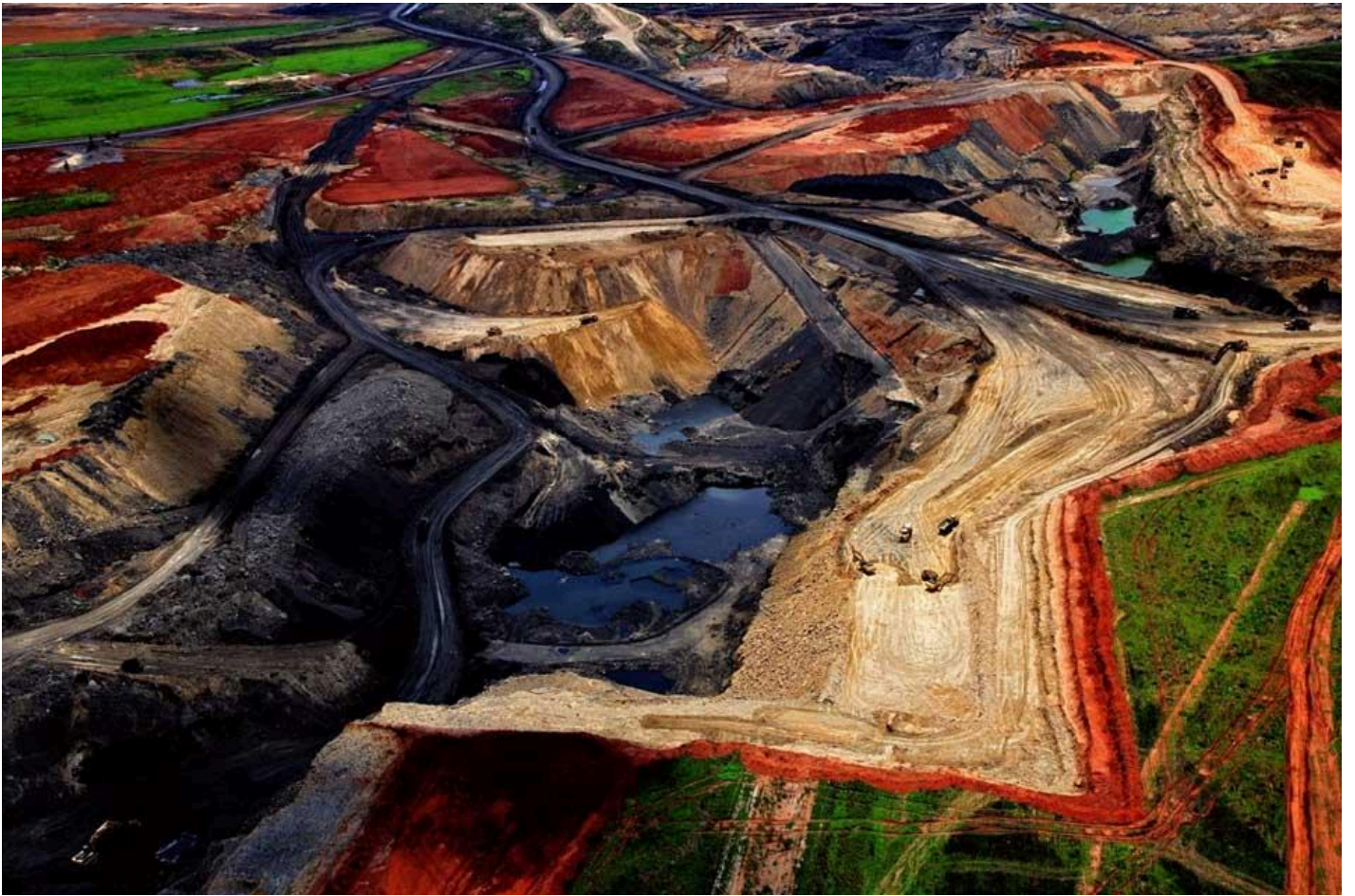
Sha Kibbutz, Israel