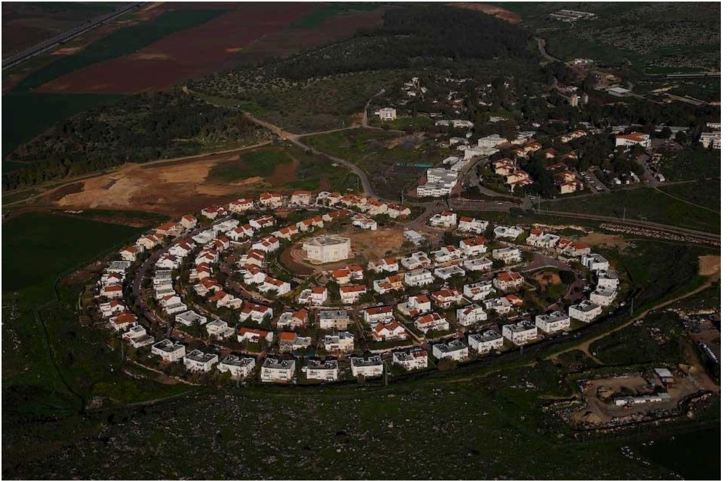
Military cemetery in Verdun, France